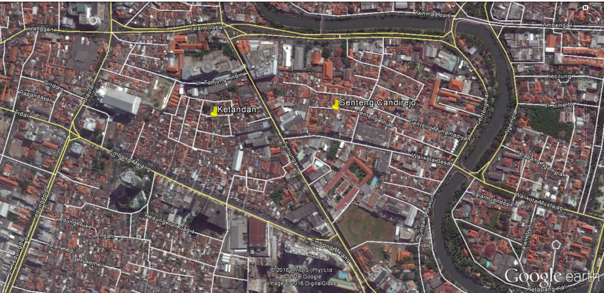
Case study: Kampung Genteng Candirejo & Kampung Ketandan