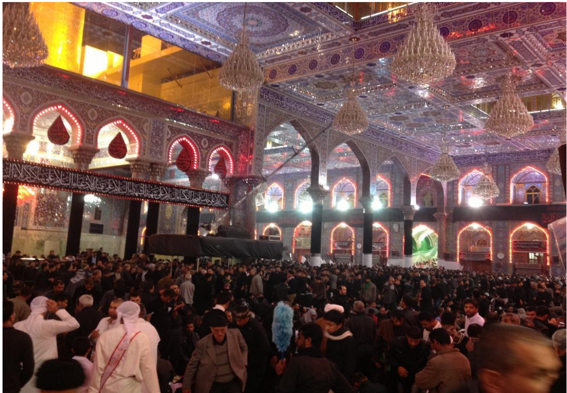
Figure 4: The shrine of Imam Hussein, which is visited by millions of Muslim Shia annually.