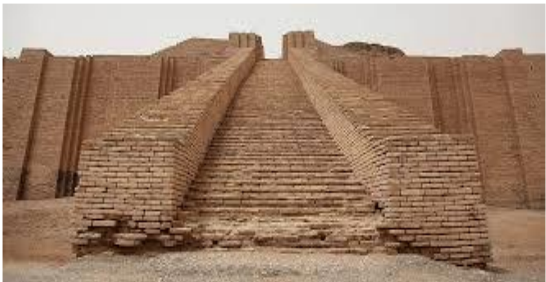
Figure 1: Ziggurat of Ur.

Iraq has played a unique role in the evolution of human civilization, with the one of oldest known communities of human settlement being on the banks of the Twin Rivers – the Euphrates and the Tigris. The great cities of Uruk, Ur (see Fig. 1 below), Akkad, Ashur, Babylon, Baghdad and Kufa have been 'the major centres of culture and power' for much of Iraq's history' (Ghareeb & Dougherty, 2004). The ancient Sumerians of Iraq "produced a whole cascade of first literacy, numeracy, monumental building, organized religion, organized warfare and state" (Maisels, 1993, p. 1).