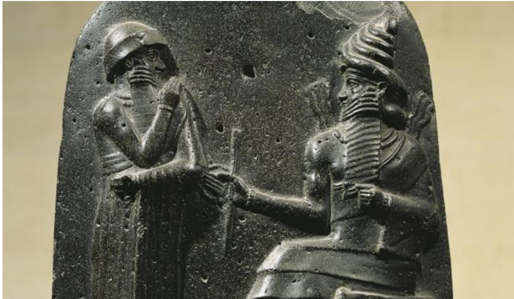
Figure 2: The Hammurabi Obelisk.

Ancient Iraqis created the first laws of humanity on the Obelisk of Hammurabi (see Fig. 2 below) and perhaps wrote the first words in the history of mankind and built up the first advanced irrigation systems.