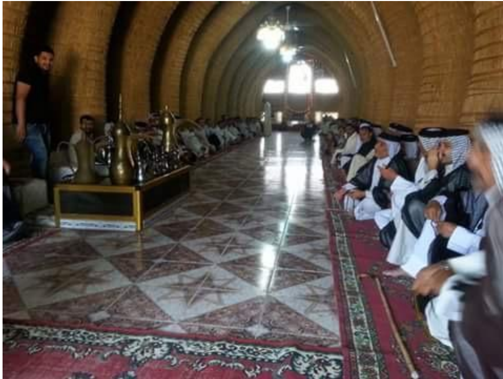
Figure5: Mudhif (the house of reeds) has a tribal and cultural symbolism that plays a large role in social, political and cultural life in the southern society of Iraq. It is the place where southern Iraqis used to gather for cultural occasions, tribal discussion making, and to solve tribal issues.

during tribal conflicts, settle disputes, resolve property claims, and enforce the tribal laws. In more modern times, Tribes and tribal authorities play an important role during the Ottoman rule, the British mandate, the Saddam Hussein regime, and the US occupation (Hassan, 2007).